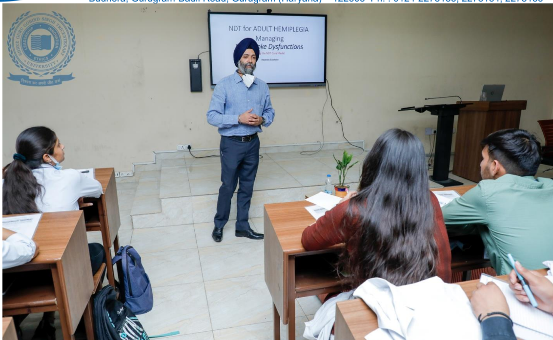
Fig 2: Speaker of the event giving basic information about NDT Technique

Budhera, Gurugram-Badli Road, Gurugram (Haryana) – 122505 Ph. : 0124-2278183, 2278184, 2278185