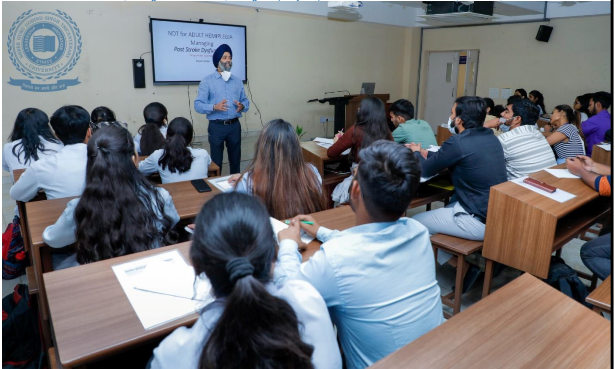
Figure 4: Resource Person answering all the questions asked by students

Budhera, Gurugram-Badli Road, Gurugram (Haryana) – 122505 Ph. : 0124-2278183, 2278184, 2278185