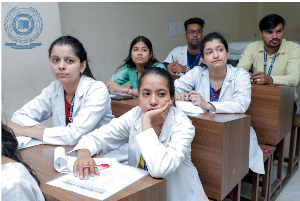
Fig 3: Students gaining knowledge from speaker